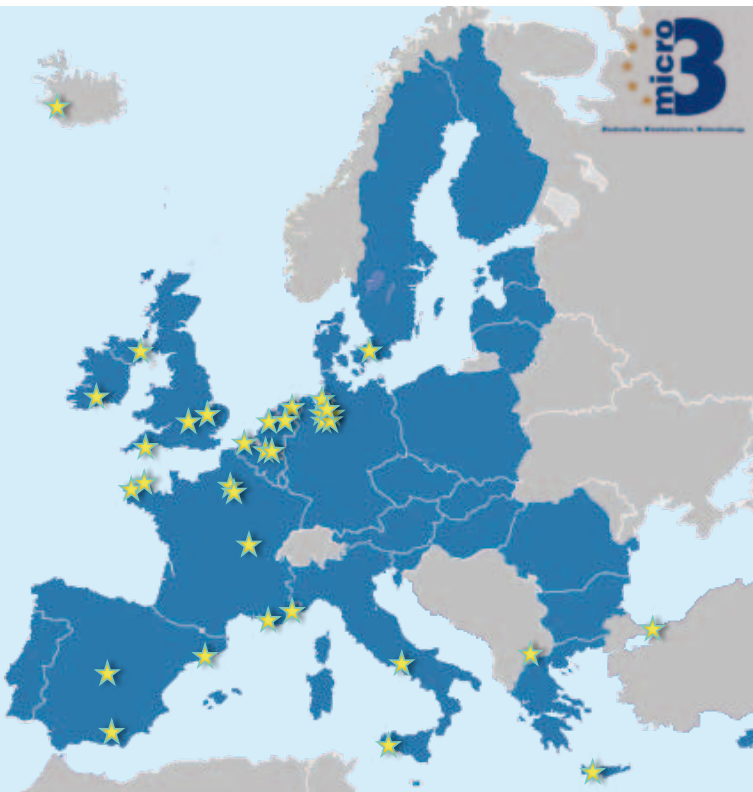
Figure 2: Map of geographical distribution of the 32 partners of Micro B3 large collaborative project