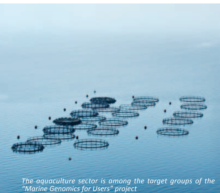
The aquaculture sector is among the target groups of the “Marine Genomics for Users” project